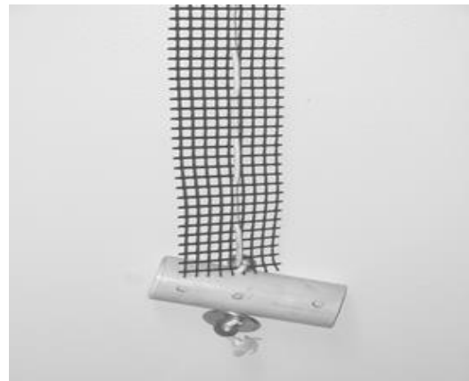
Figure 2. Image of a “Portland Sampler” substrate.

circumstances where understanding the change in an invasive mussel population is of interest, rather than just presence/absence.